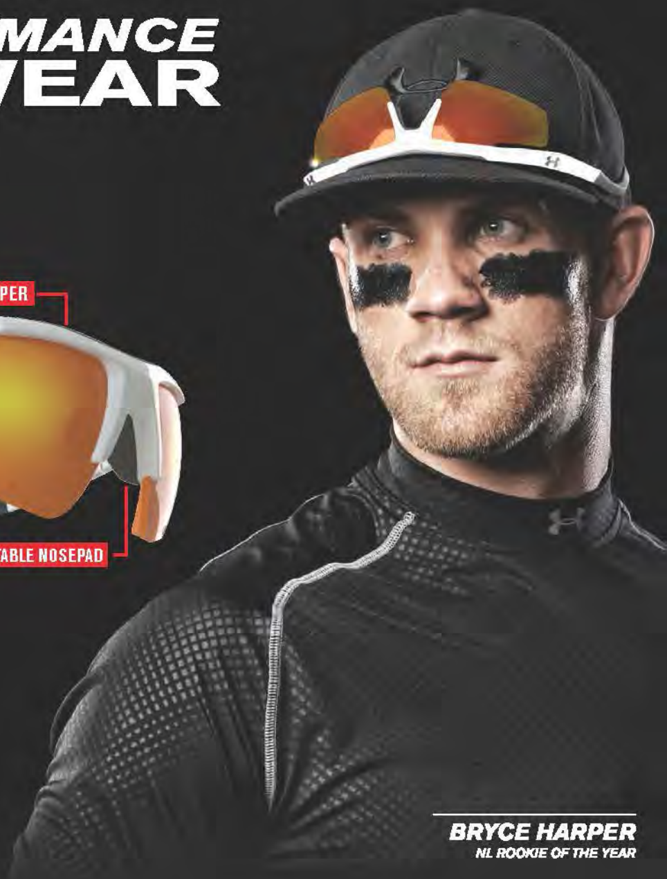
BRYCE HARPER NL ROOKIE OF THE YEAR

ARMOURFUSION™ Ultra-lightweight, impact-resistant sunglass frames.